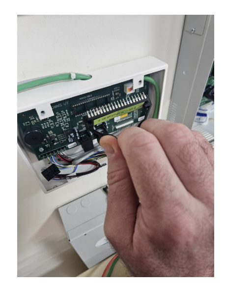
6. Use the forked tool to remove the chip as shown

5. Repeat the steps for the other side of the chip