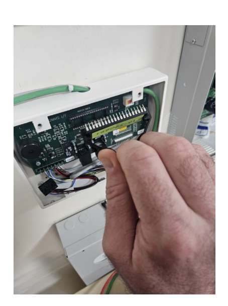
7. Package up the removed chip(s) and return to Head Office.