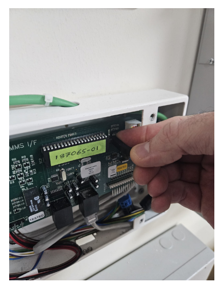
4. Rotate the remover tool round to be verical so it prises against the PCB